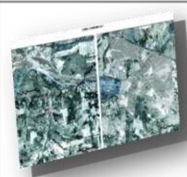
SANDY TWP EZs

SANDY TOWNSHIP, DUBOIS CITY, FALLS CREEK BOROUGH